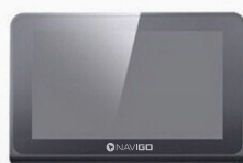
Android GPS navigation