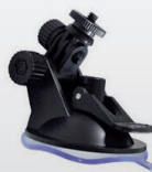
Suction cup holder